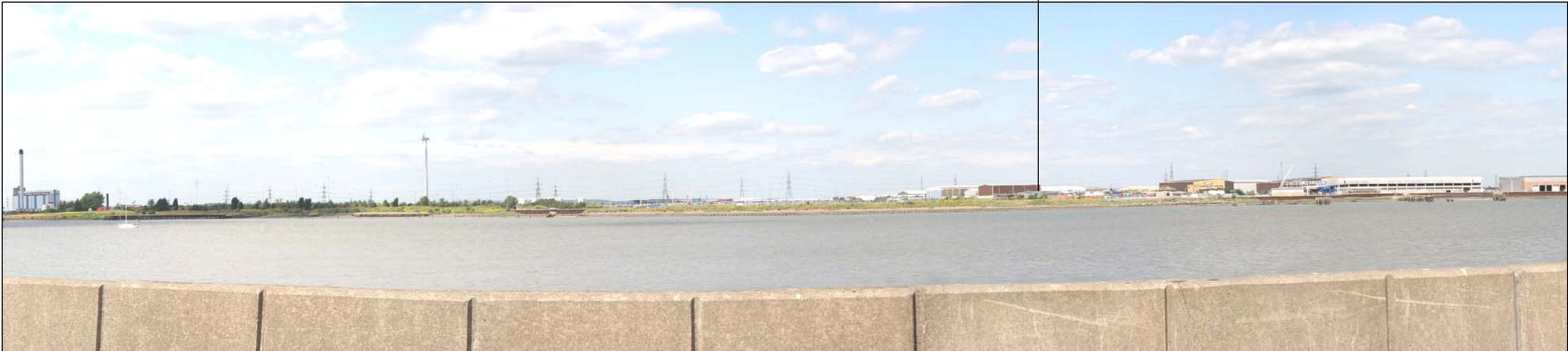
Viewpoint No. 3 before development. Thames Path at Manorway North in Manorway Industrial Park. Looking North towards Development Site.