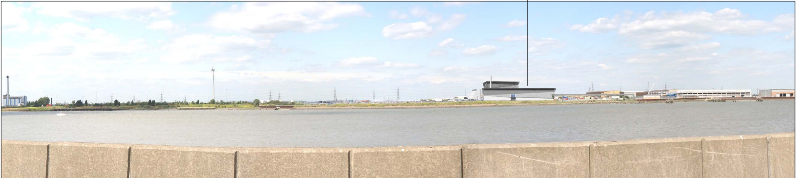
Viewpoint No. 3 after development. Thames Path at Manorway North in Manorway Industrial Park. Looking North towards Development Site. (Photomontage produced by Studio E Architects).